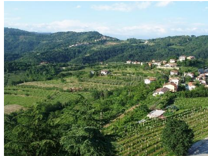
The Gorica Hills

my theories for making better sense of Bartol, most of which are based on reading his unpublished diaries, notebooks and correspondence. My transcriptions of relevant sequences from this unpublished Bartoliana figured among the required readings for the seminar and gave the students an opportunity to be among the first to discover authorial perspectives on key issues that have been obscured until now.